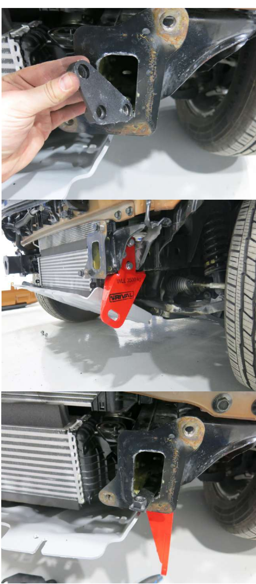
21. Insert captive pins 3xM12 (item.3) into the car frame on left and right.

22. Mount towing eyes (item 1 and item 2) on the car frame. Fasten with bolts M12x40 (item 6) and washers 12 (item 7).